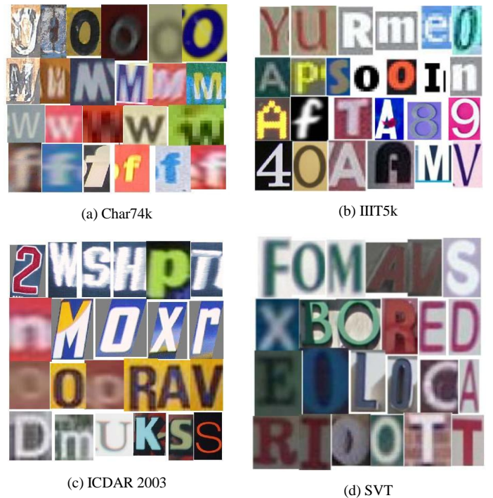
Fig. 4. Sample images of English scene characters from different datasets.

As for the Char74K dataset, we only use the English character images cropped from the natural scene images. It contains 62 character classes. A small subset is used in our experiments, i.e. Char74K-15, which contains 15 training samples per class and 15 test samples per class.