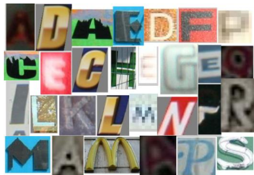
Fig. 5. Examples of correctly recognized images.

Character image segmentation results also can greatly influence the performance of recognition results. Fig. 5 and Fig. 6 respectively show some examples of correctly and incorrectly recognized character images. We can see that more accurate segmentation has higher potential of correct recognition. Moreover, serious skewed images are more difficult to be exactly recognized in comparison with that of well-aligned images and many mis-recognized examples are usually low-resolution, ambiguous and distorted images.