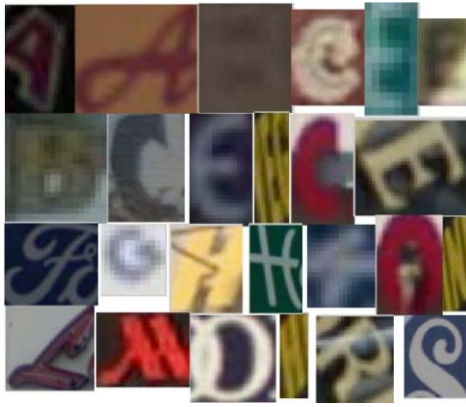
Fig. 6. Examples of incorrectly recognized images.