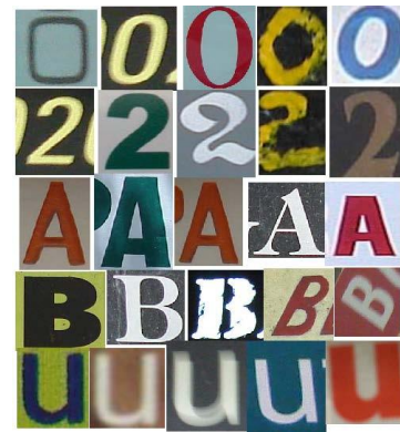
Fig. 1. Example scene character images selected from the Char74k goodImg dataset. Each row shows the samples of one class.

improved adaptive binarization algorithm, and then a commercial OCR system was used for recognition. Wakahara and Kita [9] devised a method of binarizing multicolored scene character strings using iterative K-means clustering and support vector machines. However, binarization techniques cannot segment the texts from scene images perfectly, largely due to diversity and complexity of image variations. The PhotoOCR of Google [10] uses conventional OCR on multiple binarized images to overcome the insufficiency of binarization.